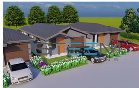
EXISTING SINGLE STOREY HOUSE