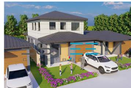
PROPOSED FIRST STOREY HOUSE